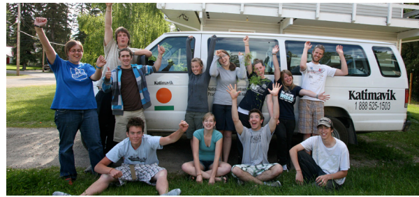
The Katimavik participants have fun outside their home in Vanderhoof.

The community is invited to the Katimavik farewell party on June 24, 5:30pm at the WL McLeod Conference Room.