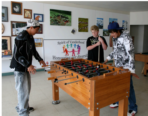
Youth enjoy the fuse ball and pool tables at the Neighbourhood Space after school. If you are interested in volunteering, the Neighbourhood Space is the place to go to link up with non-profit organizations and groups in Vanderhoof looking for volunteers.