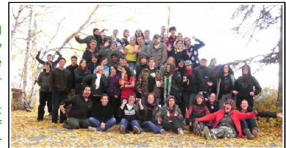
Katimavik groups met at the Ness Lake Bible Camp in Prince George and separated into 4 groups one staying in Prince George with the other three going to Quesnel, Williams Lake, and Vanderhoof.